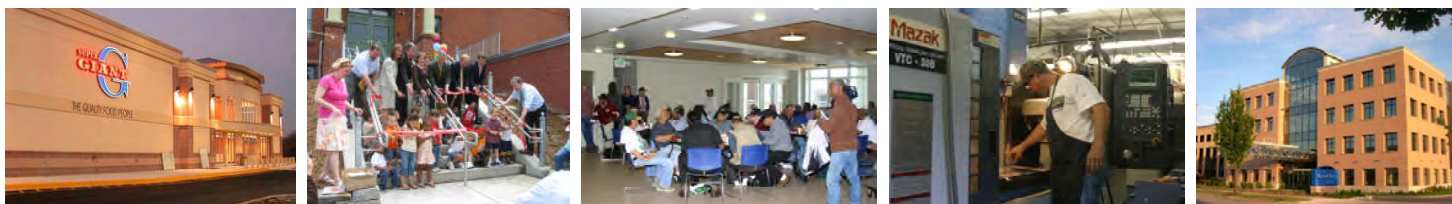
Photos (left to right): The Shops at Park Village (Washington, DC); Hope Street Child Care Center (Woonsocket, RI); LaSalle Senior Center (Seattle, WA); S&S Cycle Factory (Viola and LaCrosse, WI); Summit Place Office Complex (West Allis, WI).